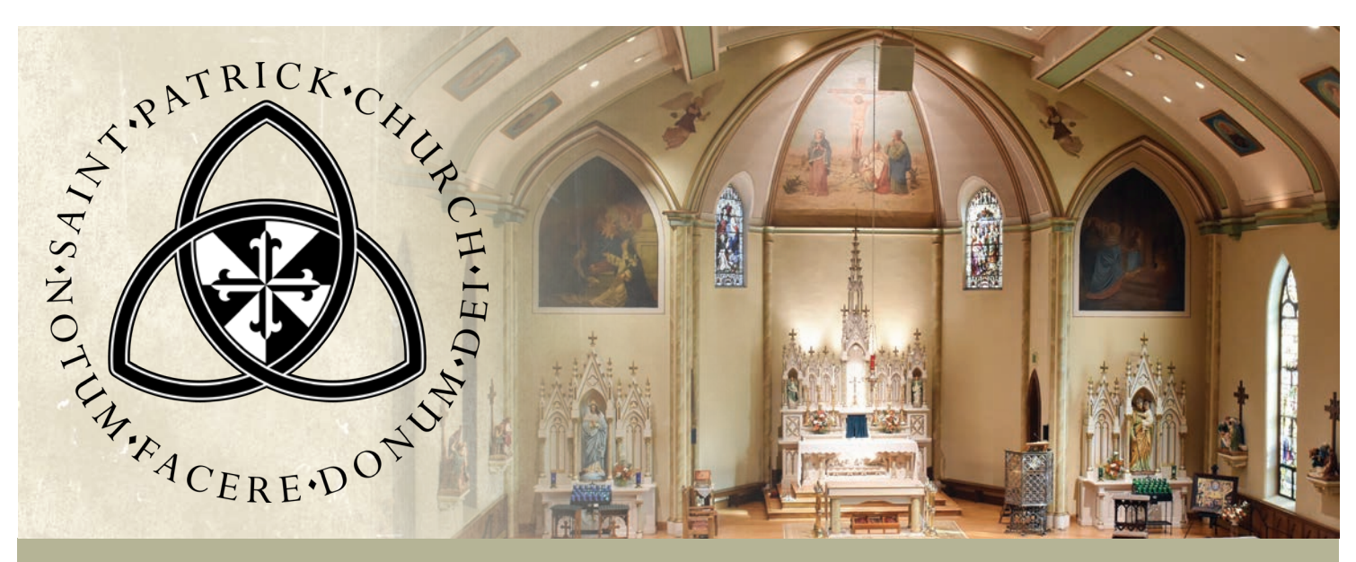
September 8, 2024 • Twenty-third Sunday in Ordinary Time