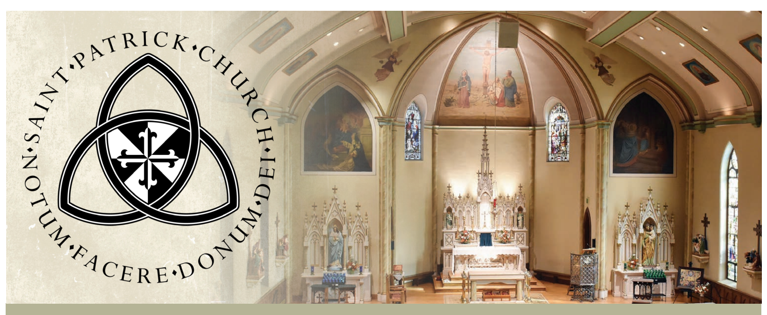
July 28, 2024 • Seventeenth Sunday in Ordinary Time