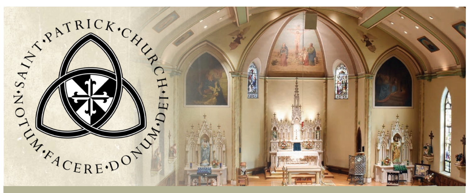
June 16, 2024 • Eleventh Sunday in Ordinary Time