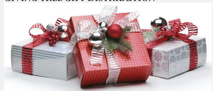
Sunday, December 8, 1:15 p.m. – 2nd Floor