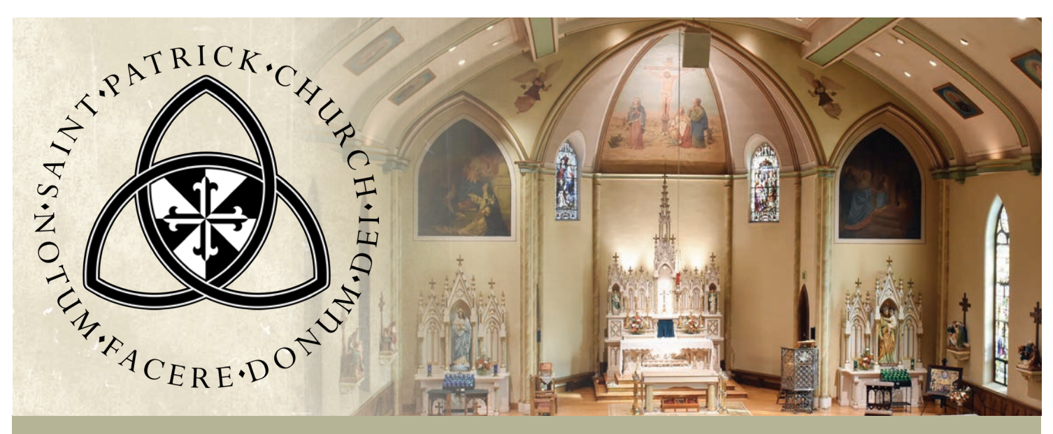
October 20, 2024 • Twenty-ninth Sunday in Ordinary Time